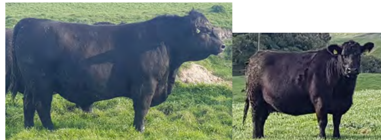
Below: Kaharau Class Man 17-444. Below Right: Goldwyn Jess H601.