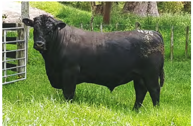
Oregon Steamin' Keith 17-90